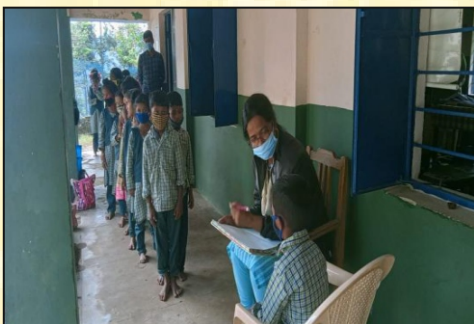
Govt. Tribal Residential School visit