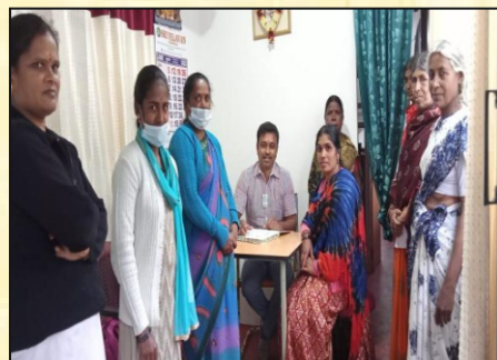
Mobile Team bringing Orthopaedic patients from the village to Kotagiri Town Tribal Hospital for treatment